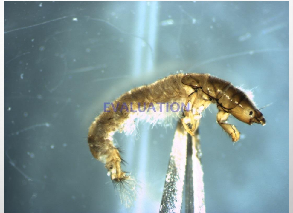
Retreat Caddisfly- Cheumatopsyche