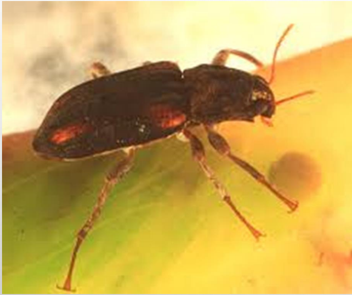
Riffle Beetle- Stenelmis