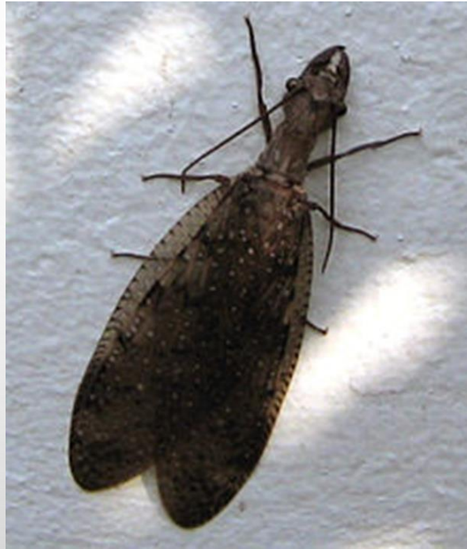
Female eastern dobsonfly- Corydalus cornutus