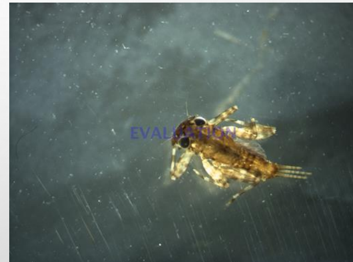
Flathead mayfly- Mccaffertium