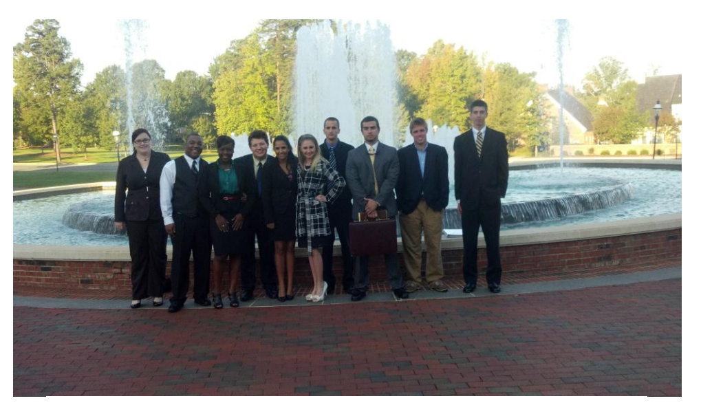
Mock Trial Team at Elon University, October 2012

Wish your classmates well as they represent our department and expertly demolish teams from other colleges and universities!