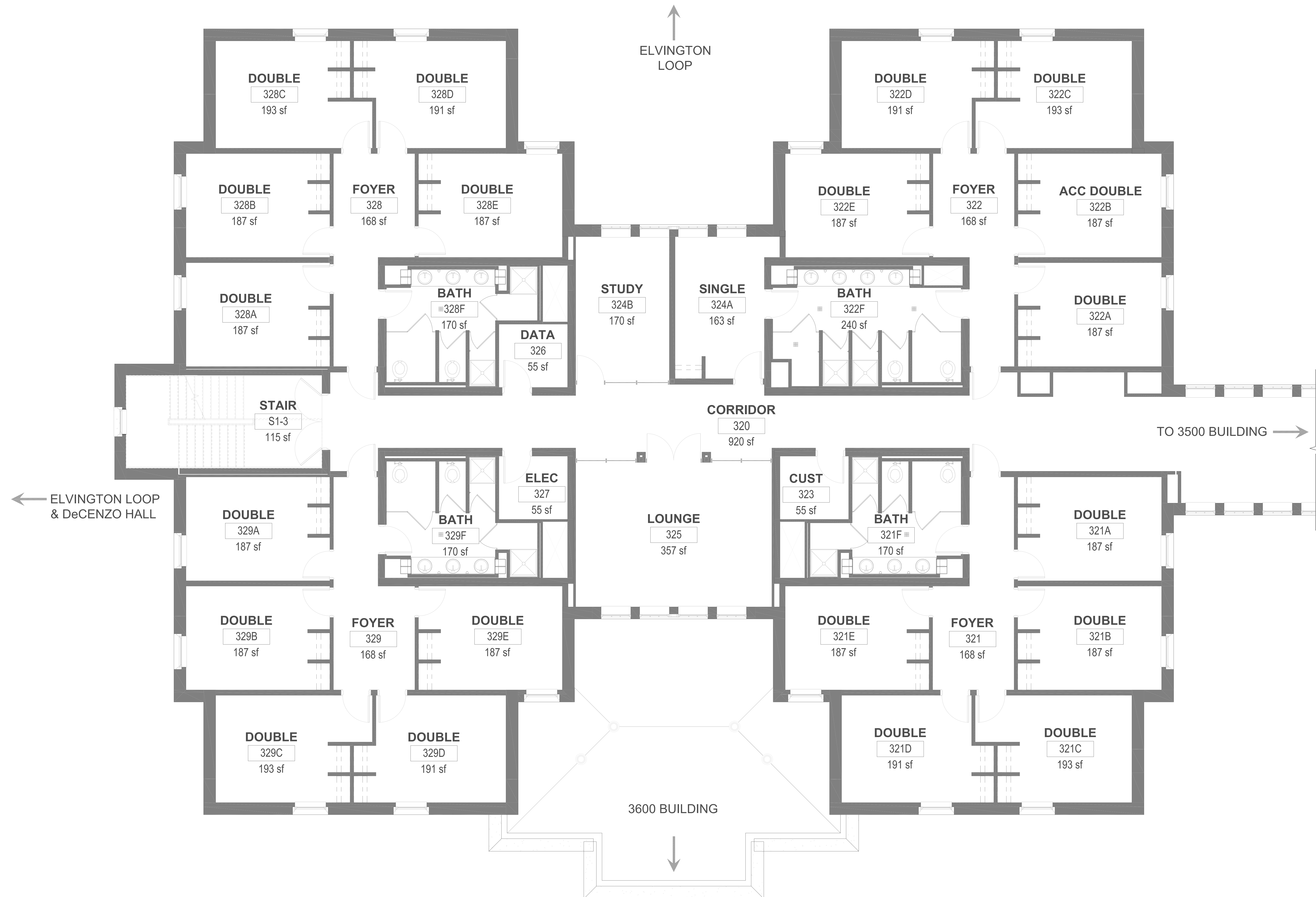
THIRD FLOOR PLAN - 3800 BUILDING SCALE: 1/4" = 1' - 0"